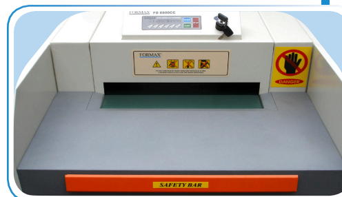
Large infeed deck with conveyor belt feeder and safety bar for immediate shut down

Keeping the 8802 Series in top condition is easy to do. With the Auto Cleaning function, clearing the blades of shredding debris is as simple as pressing Reverse on the control panel. Plus, the EvenFlow™ Automatic Oiling System lubricates the all-steel cutting blades, helping to keep the shredder in peak condition for optimal efficiency.