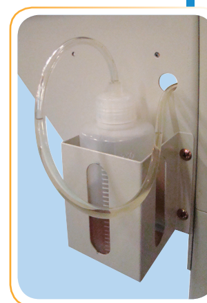
EvenFlow™ Oiling System Reservoir Bottle

Safety is an important component in the 8802 Series design and engineering. A large 18"-wide safety bar is located in front of the conveyor belt system and will shut down the shredder instantly when pressed. A safety key and lock system is also included to ensure the shredder is operated only by authorized staff.