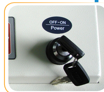
Keyed On/Off switch

The 8802 Series offers unmatched automated features through its LED control panel. The easy-to-read Load Indicator assists operators in determining how close they are to the maximum shred capacity to avoid jams and provide optimal efficiency. Indicators also notify operators when the waste bin is full or the cabinet door is open. Operators can select from two modes of operation: Auto Start/Stop or Manual. Auto Start/Stop mode utilizes optical sensors which detect paper and start/stop operation automatically. Manual mode provides non-stop operation for shredding small sized paper or films.